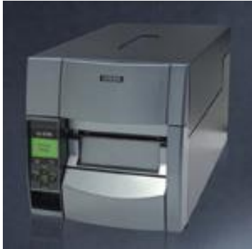
THERMAL TRANSFER PRINTERS & SUPPLIES